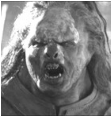
Blarg P. Hoorsensteyk

The crisis reached new heights just hours later when Hoorsensteyk's sharpest political rival, Hack Lohlkatt of the Bolshevork Party - True Way (Minority) [BP-TW(MI)], issued a statement that vigorously defended Bluh. "Embittered from his utter failure to hold the former BP-TW together", Lohlkatt wrote, "Hoorsensteyk lashes out wildly against everyone who does or does not deserve it." He also accused Hoorsensteyk's group of "acting more